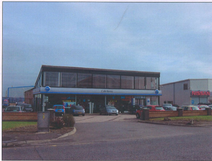
Photograph taken March 2007

Caledonia Fiat, Unit 4, Amy Johnson Way, Blackpool, FY4 2RP