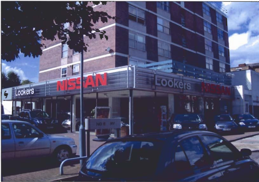
Photograph taken August 2005