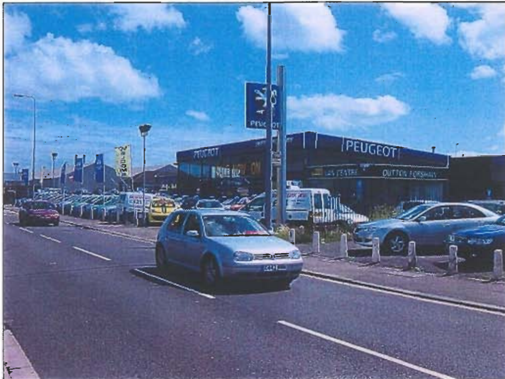
Photograph Taken July 2006