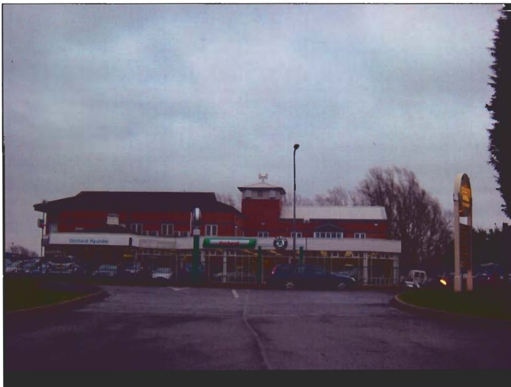
Photograph taken January 2005