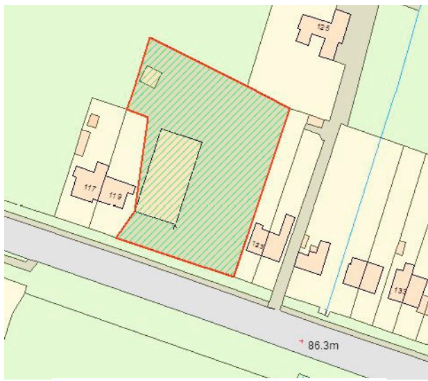
Boundary shown is indicative

We understand from the emerging planning policy within the Vale of Aylesbury Local Plan, the car dealership site is considered to be employment use.