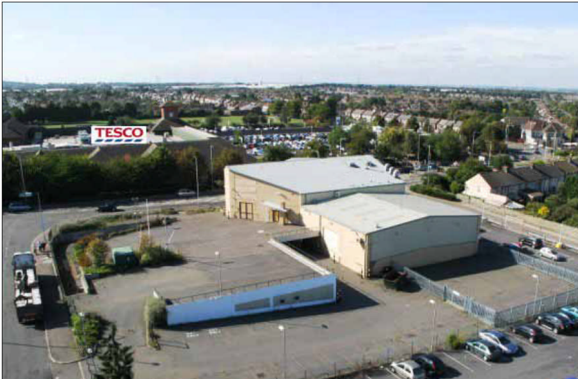
Photograph taken September 2009