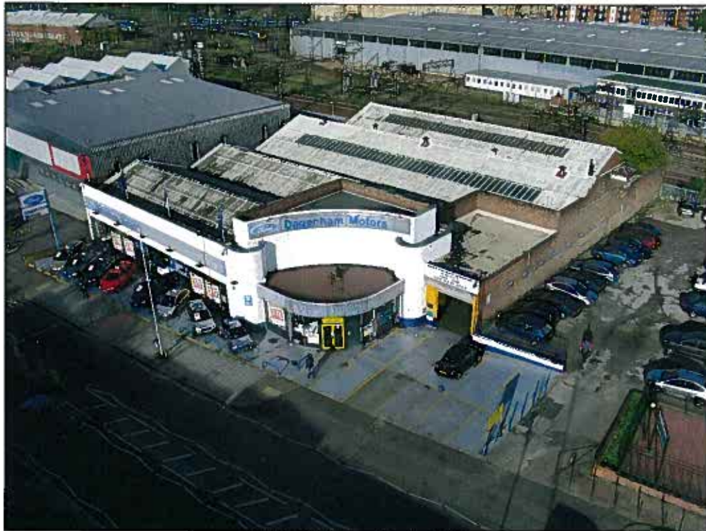
Photograph taken October 2008

Dagenham Motors, 543 High Road, Seven Kings, Ilford, Essex IG1 1TZ